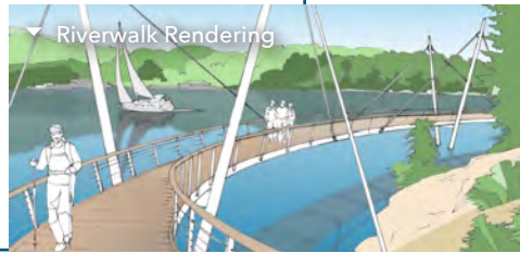
▼ Riverwalk Rendering

Once completed the entire project will boast over 5 miles of connected trails throughout our city and along Lake Hickory.