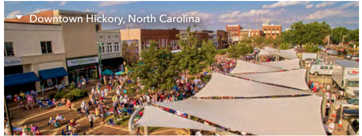
▼ Downtown Hickory, North Carolina