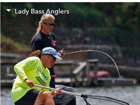
▼ Lady Bass Anglers

THE GAME WAS FUN! LOVED THE CAROUSEL AND THE MASCOTS! - ANONYMOUS EXPLORER