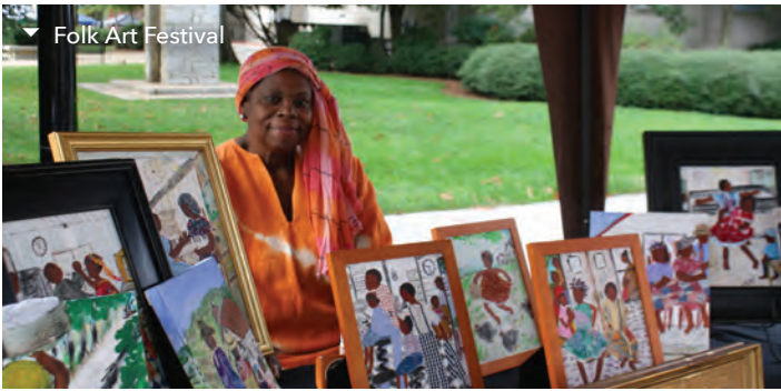
▼ Folk Art Festival