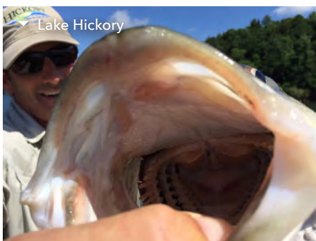
▼ Lake Hickory

Lake Hickory is located on the Catawba River in North Carolina. We are home to many fishing tournaments and water sports year round. Hosting local, regional and national events and showcasing the beautiful area around Lake Hickory we invite you to explore by boat, paddle board, kayak or even our new favorite "fly-boarding."