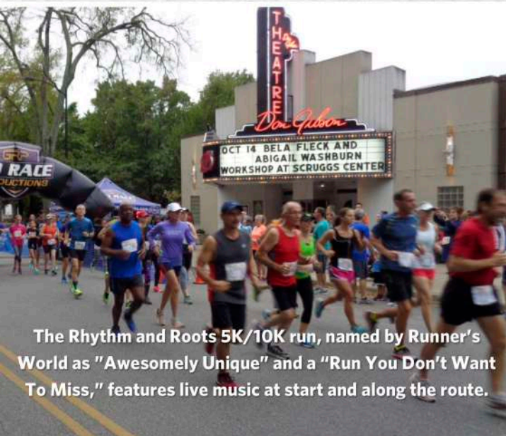
The Rhythm and Roots 5K/10K run, named by Runner's World as "Awesomely Unique" and a "Run You Don't Want To Miss," features live music at start and along the route.