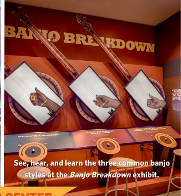
See, hear, and learn the three common banjo styles at the Banjo Breakdown exhibit.