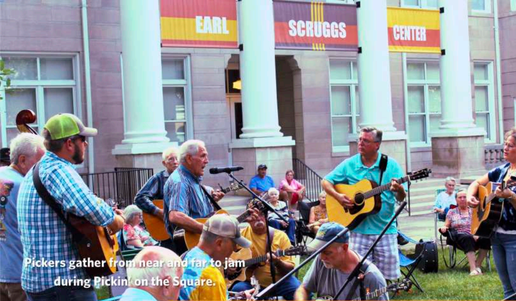
Pickers gather from near and far to jam during Pickin' on the Square.