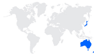
Japan, Australia and New Zealand (IANZ)