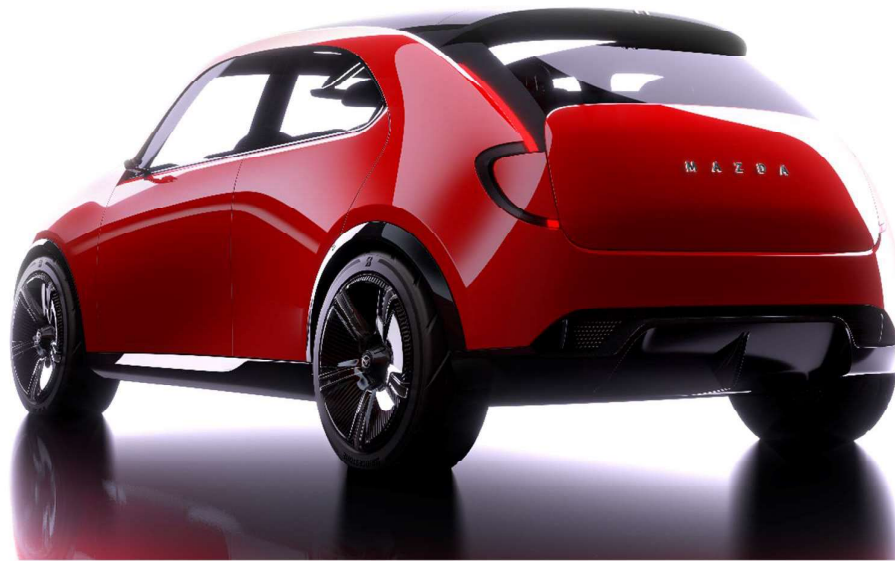
MAZDA VISION X-COMPACT

Furthermore, the All-New MAZDA CX-5 (European specification) *2, is on display to the general public for the first time ever. Featuring a spacious interior, refined KODO design, and enhanced Jimba-ittai (oneness between driver and car) driving dynamics, this model represents the evolution of a best-selling vehicle that has sold over 4.5 million units*3 across more than 100 countries and regions. This latest model is designed with MAZDA E/E ARCHITECTURE+, the new electrical and electronic architecture offering an evolved driving experience.