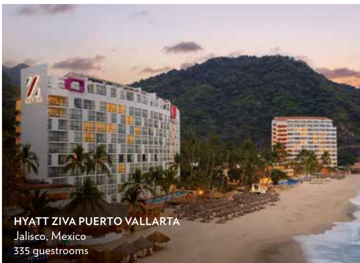
HYATT ZIVA PUERTO VALLARTA Jalisco, Mexico 335 guestrooms

Forward-Looking Statements: The term "Hyatt" is used herein for convenience to refer to Hyatt Hotels Corporation and/or one or more of its affiliates. Certain statements and assumptions in this document contain or are based upon "forward-looking" information and are being made pursuant to the safe harbor provisions of the Private Securities Litigation Reform Act of 1995. When we use the words "will," "may," "anticipate," "estimate," "should," "expect," "believe," "intend," or similar expressions, we intend to identify forward-looking statements. Such statements are subject to numerous assumptions and uncertainties, many of which are outside of Hyatt's control, which could cause actual results to differ materially from those expressed in or implied by the content of this document. Forward-looking statements made in this document are made only as of the date of their initial publication and Hyatt does not undertake an obligation to publicly update any of these forward-looking statements as actual events unfold.