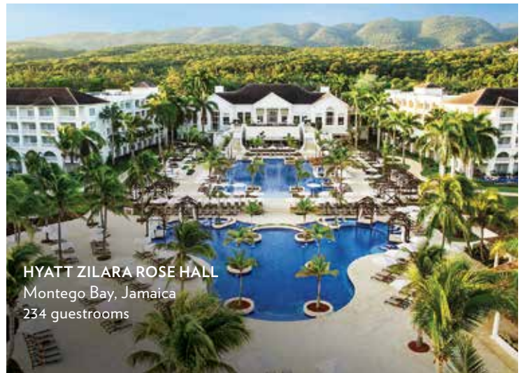
HYATT ZILARA ROSE HALL Montego Bay, Jamaica 234 guestrooms