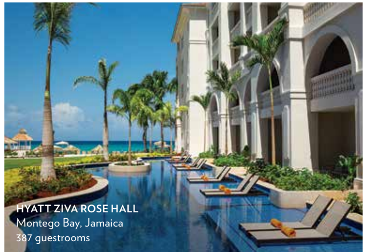
HYATT ZIVA ROSE HALL Montego Bay, Jamaica 387 guestrooms

Drive reservations with a loyal following