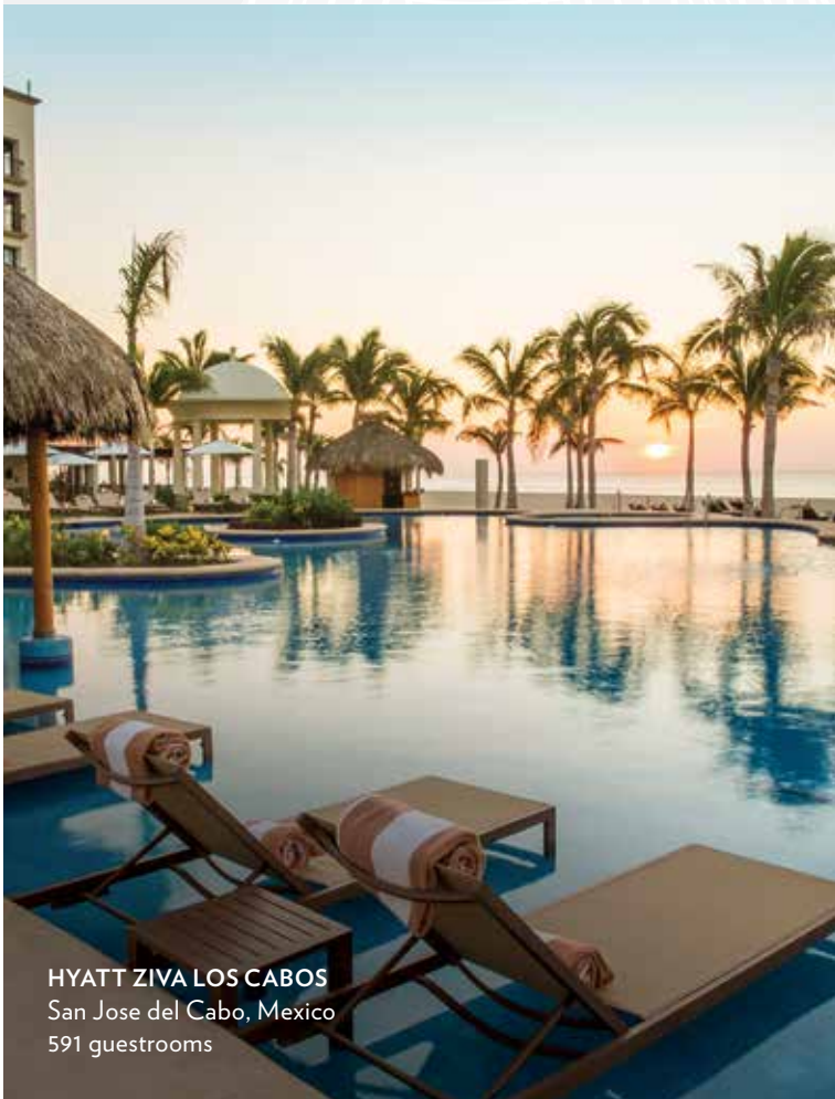
HYATT ZIVA LOS CABOS San Jose del Cabo, Mexico 591 guestrooms

Carve out an exclusive niche in the all inclusive segment by capturing the attention and loyalty of the world's high-end travelers. That's the unique opportunity in Hyatt Ziva and Hyatt Zilara resorts, each of which is designed to deliver exceptional performance in a growing market. Located in resort destinations such as Mexico and Jamaica, these properties provide experienced travelers with a new level of quality and care in an all inclusive experience.