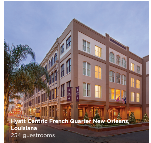
Hyatt Centric French Quarter New Orleans, Louisiana 254 guestrooms