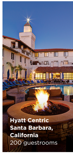
Hyatt Centric Santa Barbara, California 200 guestrooms

Visit hyattdevelopment.com for the most updated list.