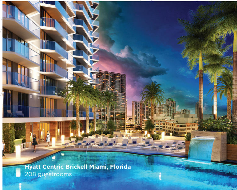
Hyatt Centric Brickell Miami, Florida 208 guestrooms