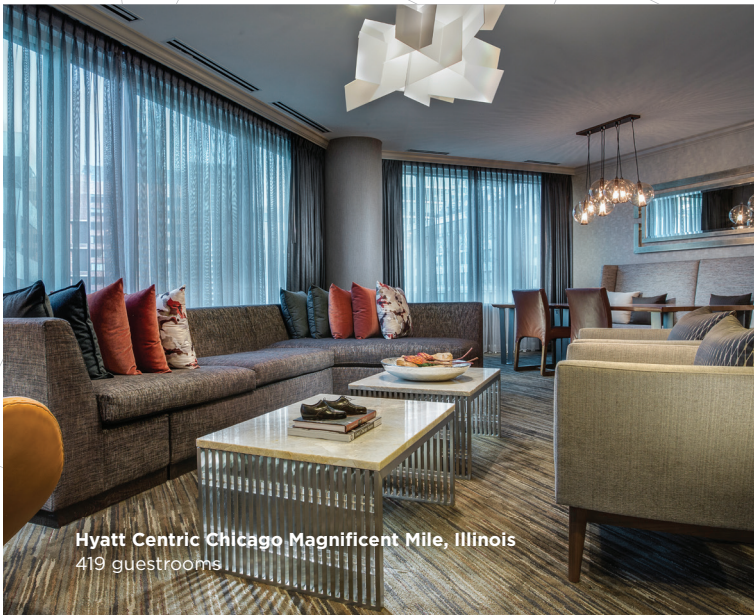
Hyatt Centric Chicago Magnificent Mile, Illinois 419 guestrooms

Each hotel is uniquely designed to capture the spirit of its surrounding culture, tapping eager-to-explore business and leisure travelers into the local scene while cultivating an environment that invites discovery.