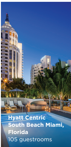
Hyatt Centric South Beach Miami, Florida 105 guestrooms