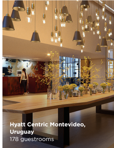
Hyatt Centric Montevideo, Uruguay 178 guestrooms