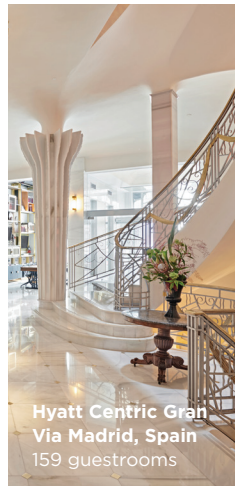
Hyatt Centric Gran Via Madrid, Spain 159 guestrooms