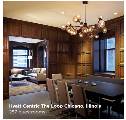
Hyatt Centric The Loop Chicago, Illinois 257 guestrooms