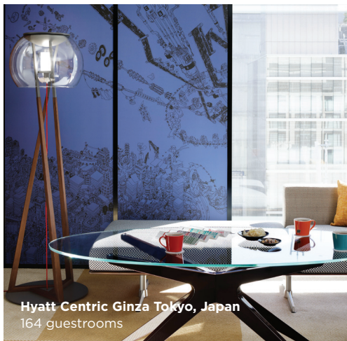
Hyatt Centric Ginza Tokyo, Japan 164 guestrooms

At the 2016 SAHIC Awards, Hyatt Centric Montevideo was named BEST NEW HOTEL