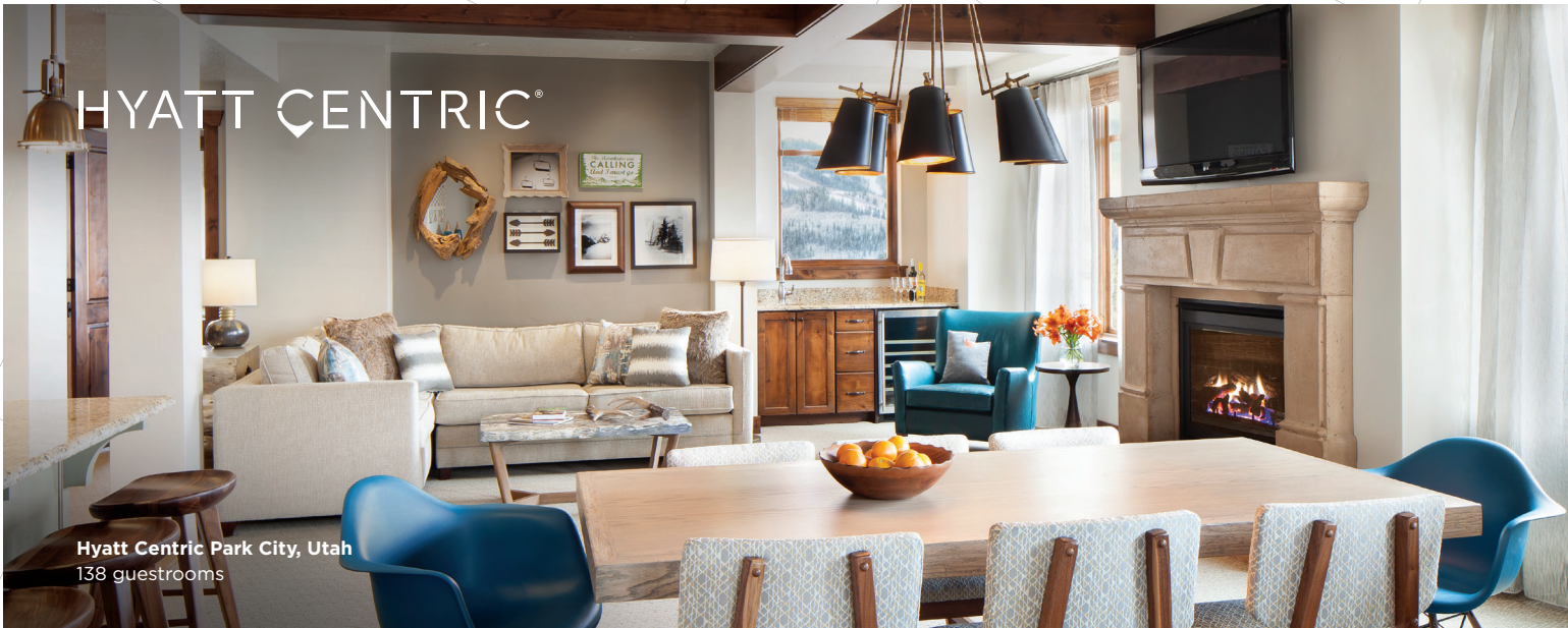
Hyatt Centric Park City, Utah 138 guestrooms