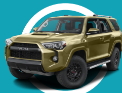
2016 Toyota 4Runner