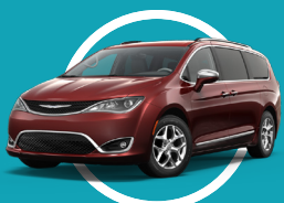
2017 Chrysler Pacifica