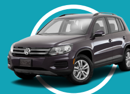
2016 Volkswagen Tiguan