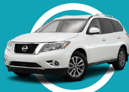
2016 Nissan Pathfinder