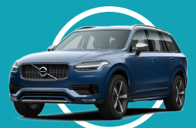
2017 Volvo XC90