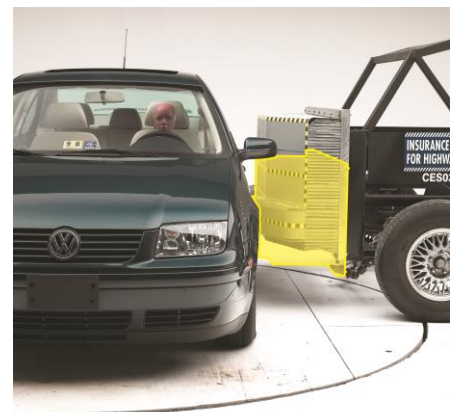
NHTSA barrier, shown in yellow, superimposed over the taller IIHS barrier

To achieve a good rating in the test, automakers strengthened side structures and equipped vehicles with head-protecting side airbags ahead of a federal regulation that made them essentially mandatory. Only about 1 in 5 vehicles tested earned good ratings in the beginning. Today, 99 percent of rated vehicles earn a good rating, and the remainder are acceptable.