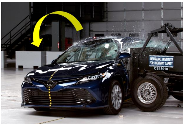
Movable barrier: Test vehicle rolls away from striking barrier

The crashes with the movable barrier weren't identical to the crashes with a second vehicle. Video footage showed that the struck vehicles rolled away from the barrier but toward the striking vehicles.