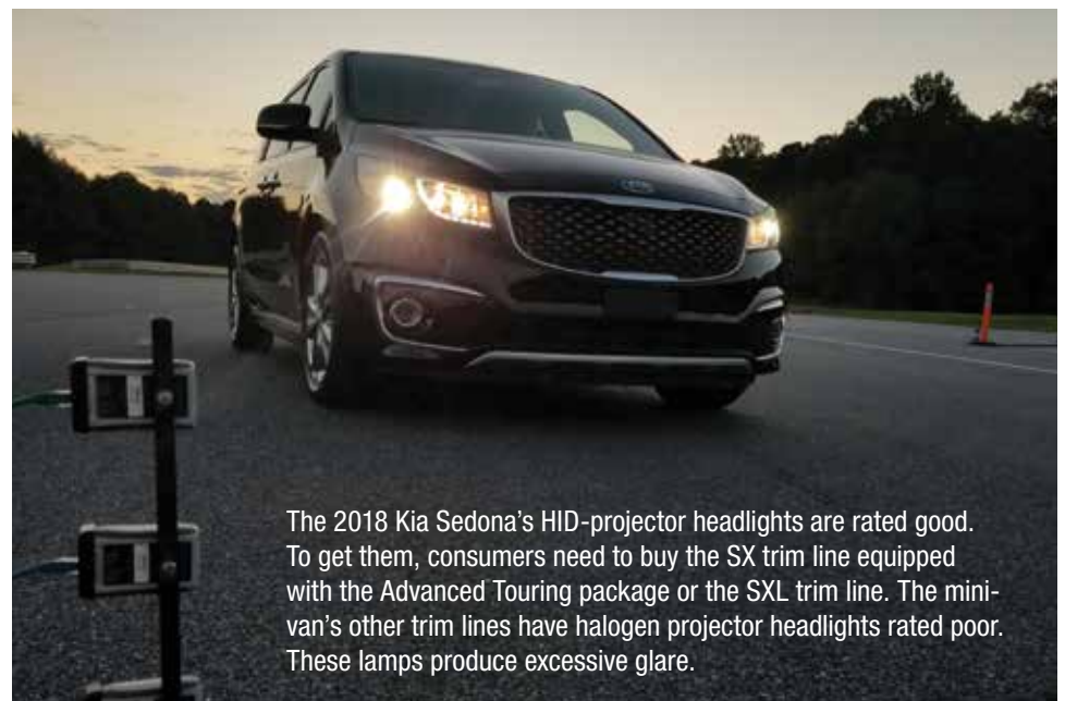
The 2018 Kia Sedona's HID-projector headlights are rated good. To get them, consumers need to buy the SX trim line equipped with the Advanced Touring package or the SXL trim line. The minivan's other trim lines have halogen projector headlights rated poor. These lamps produce excessive glare.

High-beam assist is quickly gaining traction — 45 percent of the 2018 models evaluated have the feature, up from 37 percent in 2017. High-beam assist automatically switches between high beams and low beams, depending on the presence of other vehicles. Research shows drivers rarely turn on their high beams. High-beam assist helps boost driver use of high beams. Vehicles with the feature get extra credit in IIHS headlight evaluations. ■