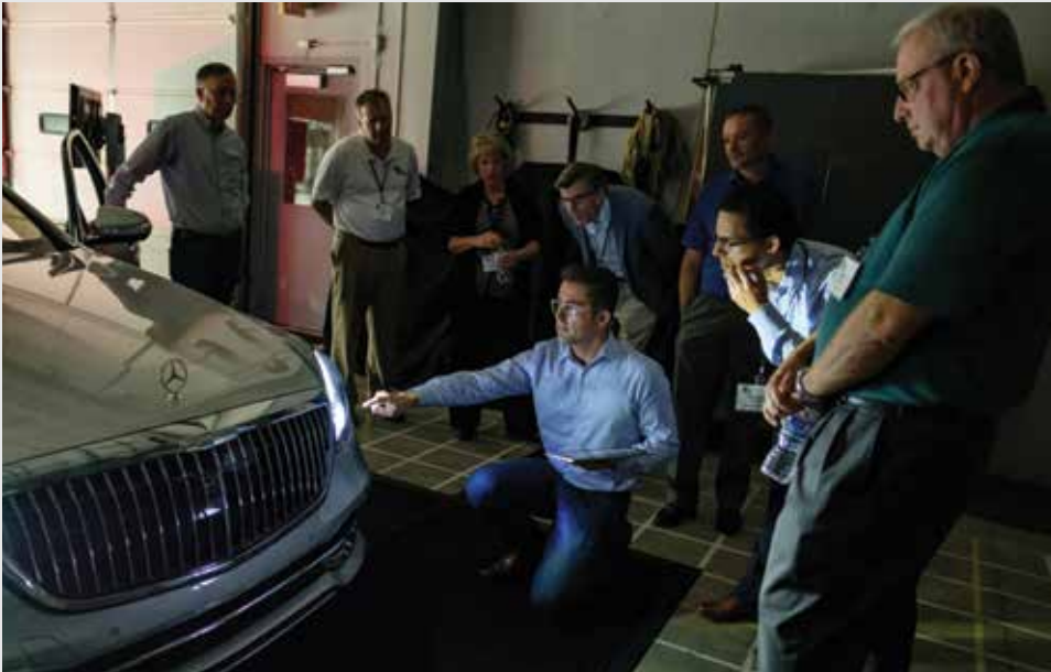
IIHS-HLDI Board of Directors members preview an adaptive-driving-beam headlight system from Mercedes-Maybach during a September meeting at the Vehicle Research Center. Adaptive driving beams are used in Europe, Japan and other markets but currently are prohibited in the U.S.

Automakers who already provide adaptive-driving-beam headlights on vehicles they sell